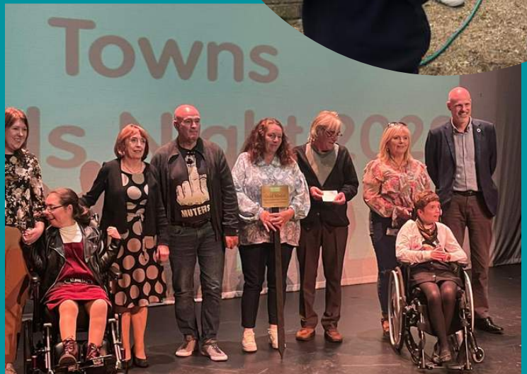
Ballymun Tidy Towns Competition 2022

Dublin City Neighbourhood Awards Community Gardens - Runner Up 2022