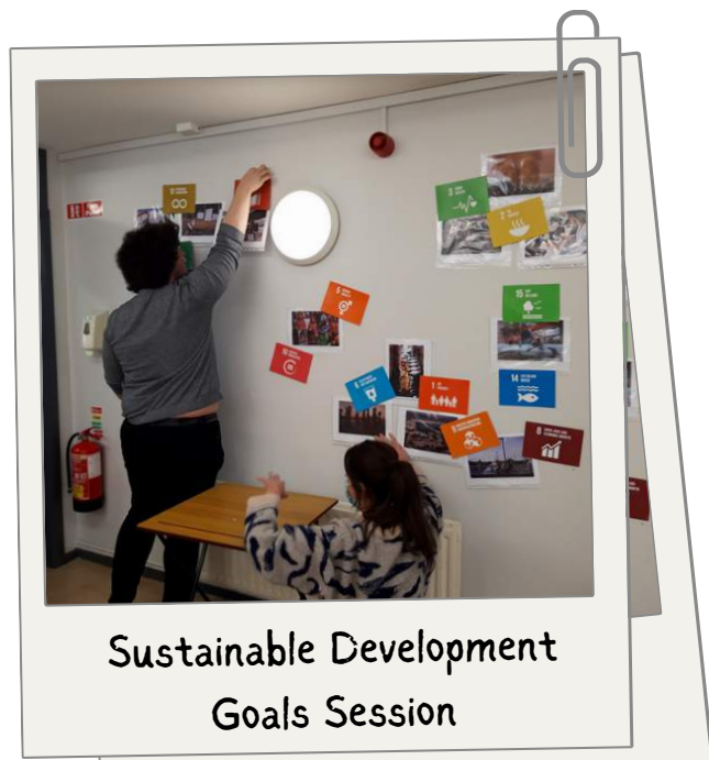
Sustainable Development Goals Session

ACT (formerly Action for Global Goals) is our adult and community education programme. Funded by Irish Aid, this project supports community groups and adult learners to understand the interconnected dimensions of sustainable development, and to take action in their local communities. Through community toolkits and workshops, ACT builds knowledge and action on the UN Sustainable Development Goals (SDGs)